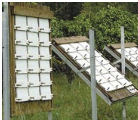
LP SmartSide siding placed on 45- and 90-degree walls for accelerated performance testing.

90-degree angle wall – and helped show how LP SmartSide siding would perform over the long term. To date, we've been testing for nearly